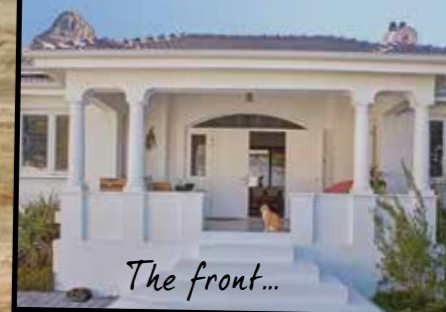
The front... ...and the back!

The covered stoep is jokingly referred to as “the black lung” because of the residue above the fireplace, but roof paint in dark grey works magic on the wall. >> Coffee table from Weylands; cane chairs from Anouk Furniture; downlights from Lightworld