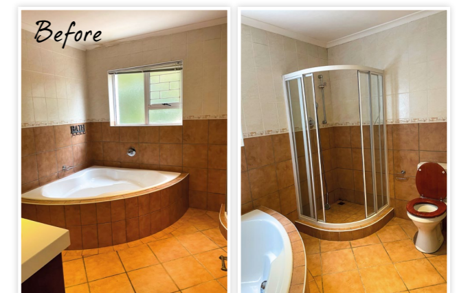
The corner bath was old-fashioned and took up a lot of space, while the corner shower was very small with rickety sliding doors.

For the main en-suite bathroom, Beatrice chose a botanical wallpaper from Cara Saven Wall Design called Secret Garden. >>