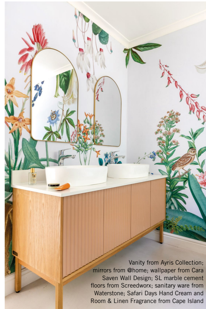
Vanity from Ayris Collection; mirrors from @home; wallpaper from Cara Saven Wall Design; SL marble cement floors from Screedworx; sanitary ware from Waterstone; Safari Days Hand Cream and Room & Linen Fragrance from Cape Island

The oak veneer vanity adds warmth to the cement floors, while the contemporary yet classic reeded doors repeat the reeded effect featured elsewhere in the home. The engineered stone tops are durable.